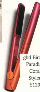
ghd Bird of Paradise Coral Styler, £129