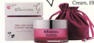
Elemis Pink Jar Pro-Collagen Marine Cream, £99

Elemis is donating £10,000 to Breast Cancer Care